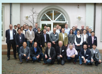
Figure 1: Participants at the Task 22 meeting in Heidelberg, Germany 6-10 May 2012