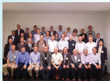
Figure 2: Participants at the Task 22 meeting in Kyoto, Japan 26-27 October 2012